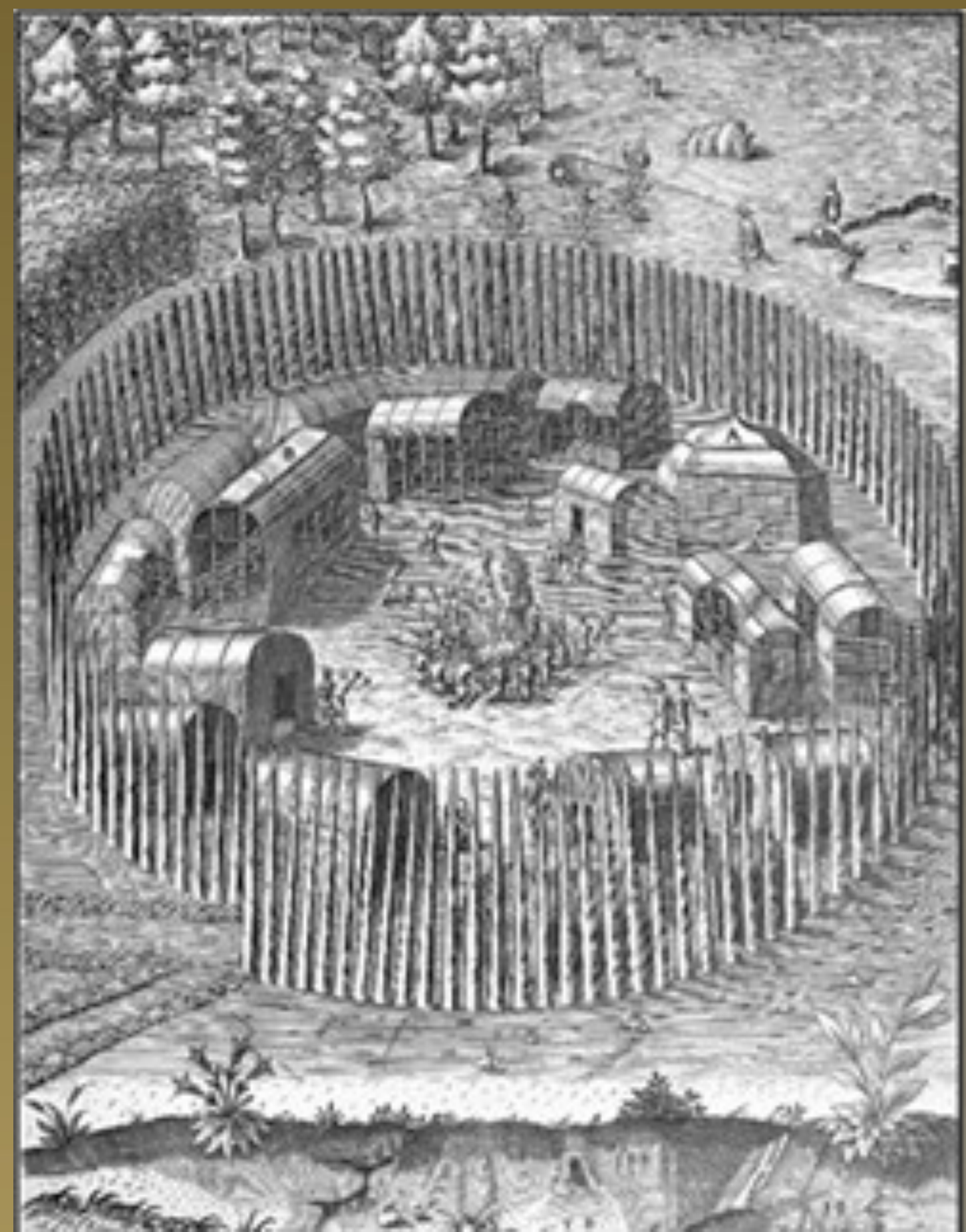
Figure 2. Town of Pomeiooc as illustrated by Theodor de Bry (Harriot 1590 in Hulton 1972).

Records written by Europeans describe sunflowers growing interspersed with maize (Heiser 1951) while other accounts depict sunflowers growing near the village periphery (Hulton 1972). Aside from the aesthetic and nutritional value, it is not surprising sunflowers became a standard component in indigenous agriculture and gardens. In recent decades sunflowers have increasingly been recognized for the beneficial roles they can play in commercial agriculture.